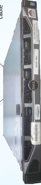
SDI GRB Appliance