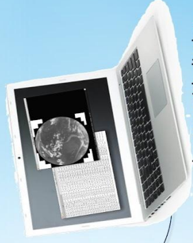
Laptop with display software