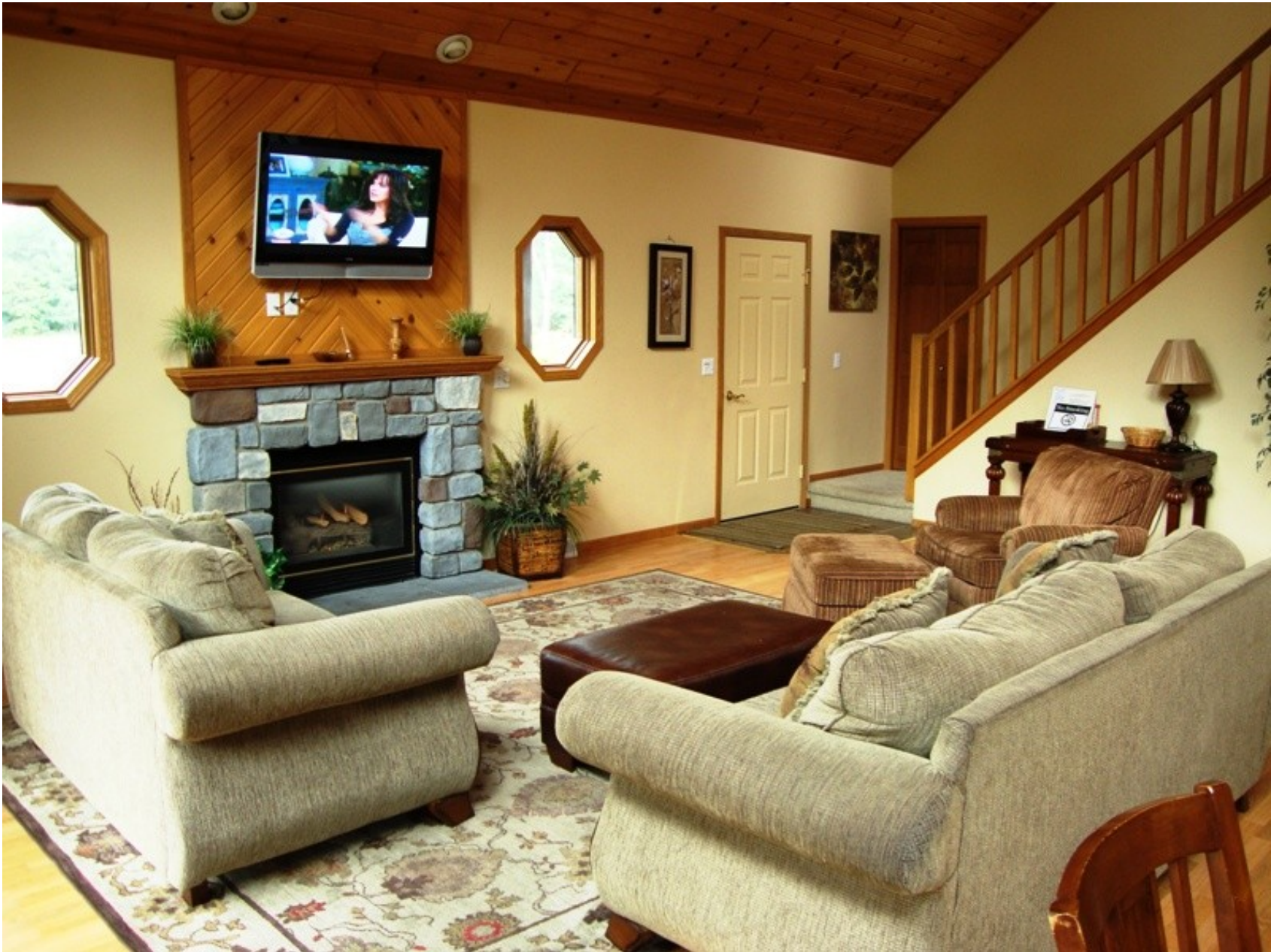
124 Sandstone Dr, Lake Delton, WI